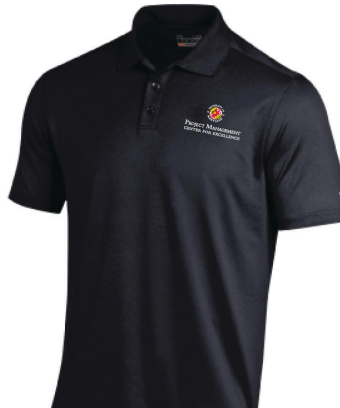
Black Polo Shirt