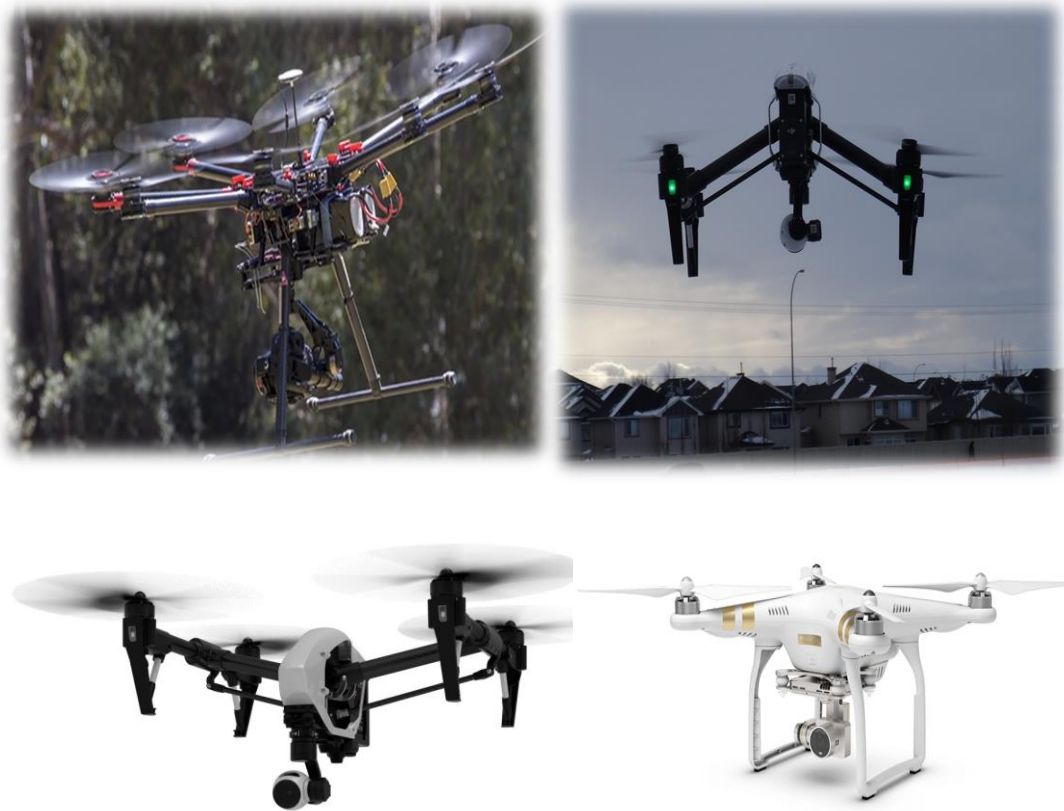
Modified Multirotor UAVs for aerial photogrammetry and surveying, equipped with Infrared and Sonar

The main advantages, of multirotor UAVs are the Vertical Takeoff and Landing (VTOL) and capability to hover and perform agile maneuvering in small spaces. Multirotor UAVs are suitable platforms to inspect urban facilities such as bridges, power plants (fossil or nuclear fuel based), municipal buildings, hospitals and emergency centers. These types of UAVs are also able to carry different types of emergency packages such as CPR and emergency first aid kits to area with limited access. Multirotor UAVs enable the building inspectors to assess the building situation and define the possible damages with high level of accuracy and in a timely manner.