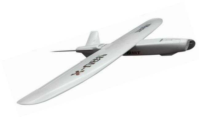
Modified long range Talon system