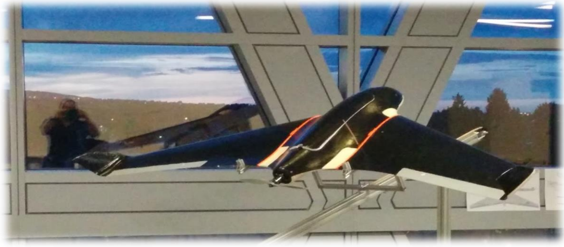
Modified long range Skywalker X8

some critical infrastructure such as roads, railways, water, oil and gas pipe lines as well as power transmission lines.