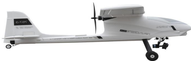
Modified long range Talon system

Modified Fixed Wing UAVs for aerial photogrammetry and surveying, equipped with Infrared and Sonar